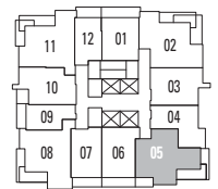
LEVELS 15-40 (EXCLUDING LEVEL 34) NORTH